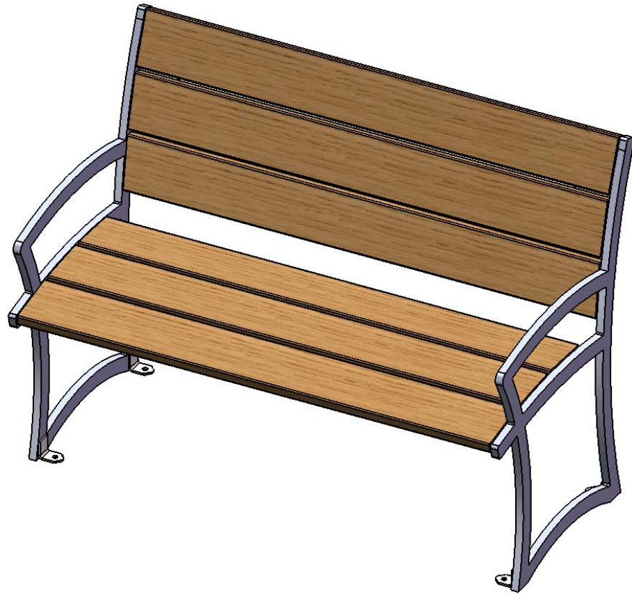
Model # 71-I4